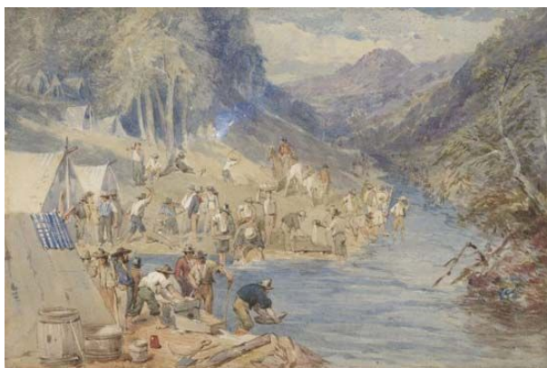
People panned for gold in the Bendigo region of Victoria, Australia,...