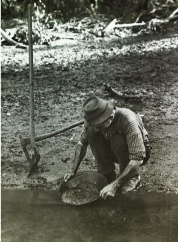
A man pans for gold in Australia in the late 19th century. Panning...