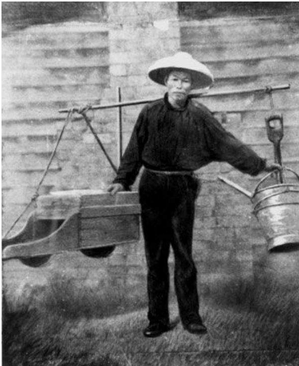
A Chinese gold miner uses a yoke to carry his mining tools.