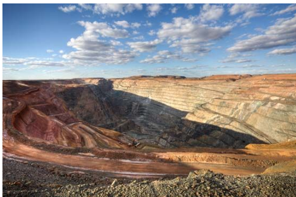
The massive Super Pit gold mine at Kalgoorlie, Western ...