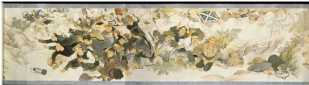
A scroll represents the Lambing Flat Riots, when white miners attacked Chinese miners. The riots led ...