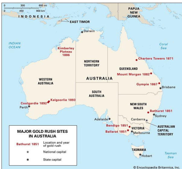
A map shows the locations and years of major Australian gold rushes.

The discovery of gold in New South Wales in 1851 began a series of gold rushes in colonial Australia. These gold rushes transformed Australia’s population and society. Miners from all over the world left their homes and tried to strike it rich on the Australian goldfields. Most were unlucky, but they all helped shape a defining era of Australian history.